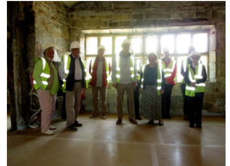
Society members at the Calverley Old Hall

Our visit to Calverley Old Hall, in June, allowed us to see (wearing hi-vis jackets and hard hats – see photo) the work being undertaken in converting this semi ruined Grade 1 listed mediaeval manor house into a holiday let; not as brutal as it sounds. The Landmark Trust is putting enormous care (and money!) in restoring an “at risk building” for future generations. In doing so, they have uncovered rare 16th century wall paintings which will be preserved. An excellent visit. Incidentally, once finished in February 2024, they will have an open day to allow visitors to see the finished building.