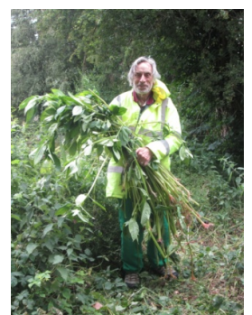
Balsam bashing in progress

Unfortunately, not many turned up for this year’s July annual balsam bashing. The benefits of previous year’s work were evident with only minor regrowth in the areas where we have previously “bashed”. However, as can be seen, we found plenty of Himalayan Balsam to remove and have left plenty for next year’s efforts.