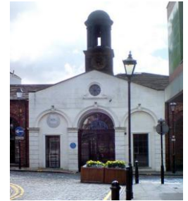
Third White Cloth Hall

In June, we visited Third White Cloth Hall in Leeds. We had not realised that this was once a very large building which not only housed the market for selling white cloth, but also the assembly rooms of Georgian Leeds. Some of the Cloth Hall was destroyed to make way for the railway connection to York, but the assembly rooms remain virtually intact. Today it houses the Kadampa Meditation Centre, who have restored the assembly rooms to their former glory.